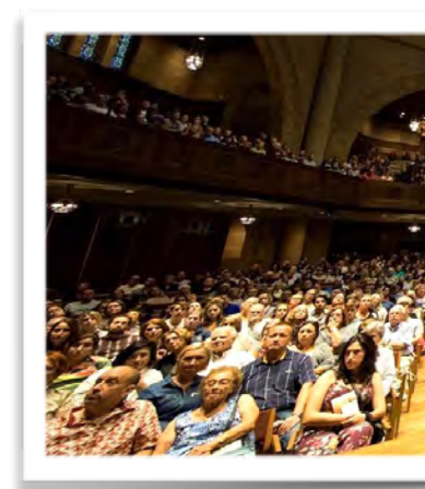
Hosting Jewish Fre