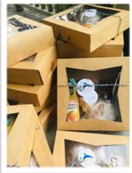
Shavuot to Go