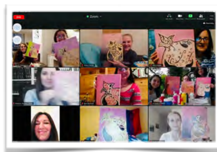
Virtual Girls Night