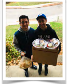
Shabbat across CWRU