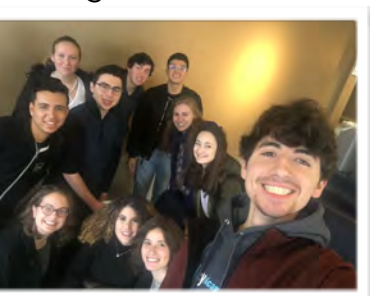
Events at the CIM