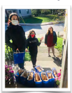
Shabbat to Go